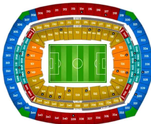
New Jersey Stadium, New York